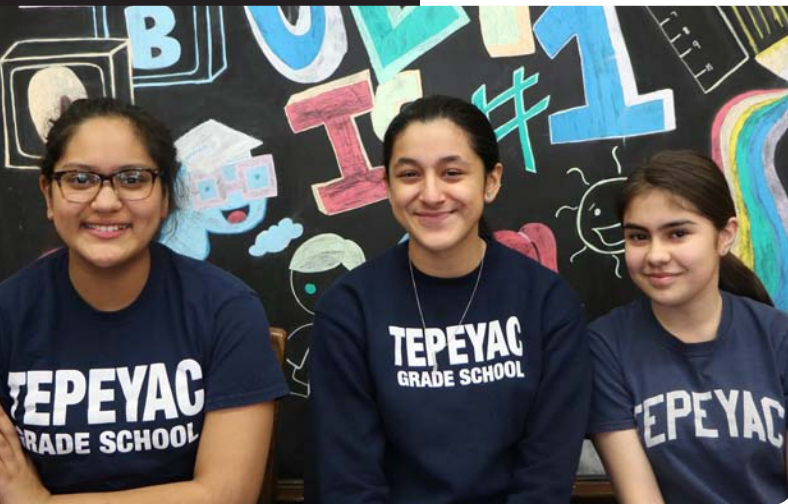
Our Lady of Tepeyac students.

Nearly 2,000 students this year alone continue to receive a quality education at the schools of their choice.