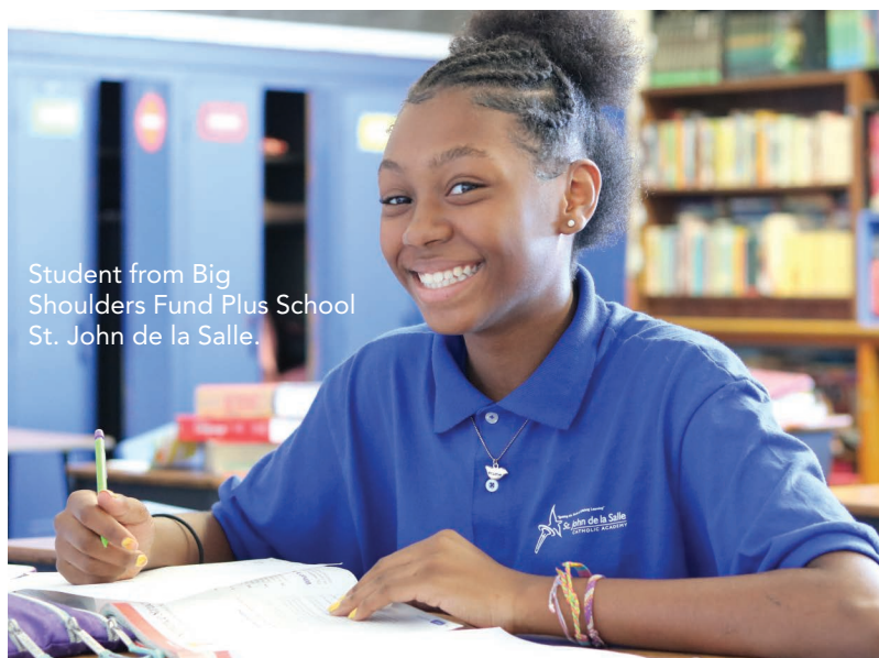
Student from Big Shoulders Fund Plus School St. John de la Salle.

Under the agreement, the 30 schools will remain part of the Archdiocese of Chicago, which will continue to provide financial support but at a decreased level than previous years.