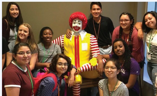
SQ Scholars baked cookies last year at the Ronald McDonald House for families of patients at Lurie Children’s Hospital, Chicago.